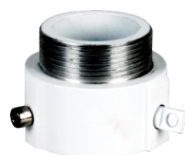
A37 Installation Adapter