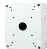
811 Junction Box