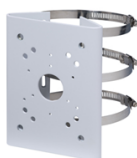
A36 Pole Mount