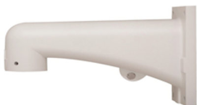
DF20Y Wall Mount